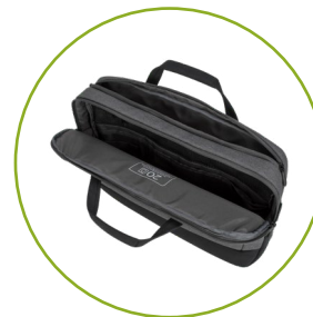
2 main compartment