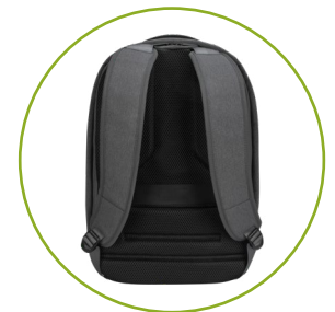
Padded back panel