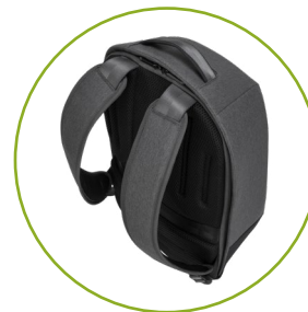
Comfortable ergonomic straps