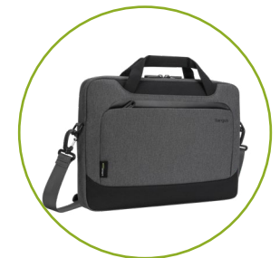
Air mesh shoulder strap