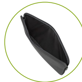
Main compartment for laptop