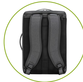
Comfortable ergonomic straps