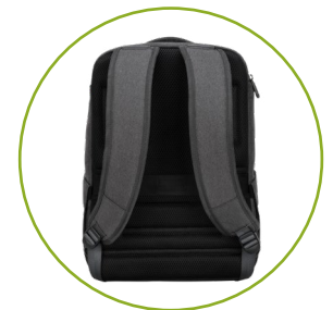
Padded back panel