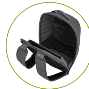
2 main functional compartments