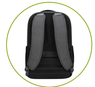
Padded back panel and luggage strap