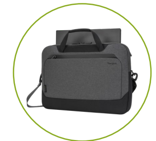
Air mesh shoulder strap