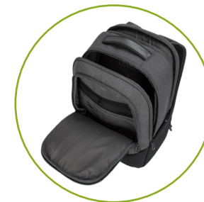
3 main functional compartments