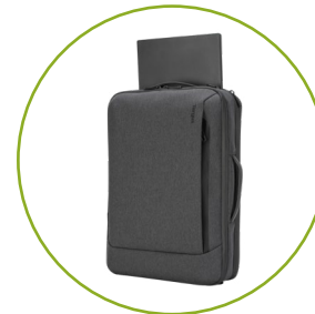
All-in-one backpack and briefcase