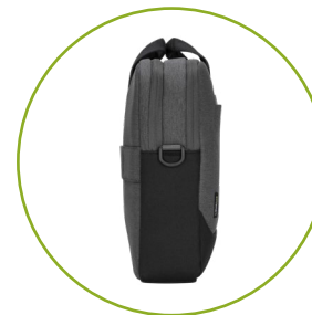
Comfort carry handles