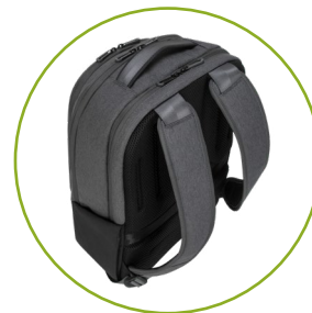
Comfortable ergonomic straps