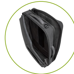
2 main functional compartments