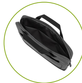
1 main compartment