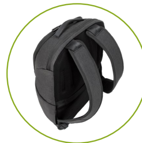
Comfortable ergonomic straps