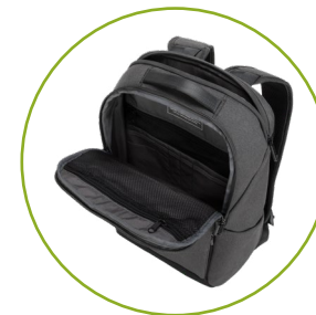
2 main functional compartments