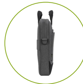
Comfort carry handles